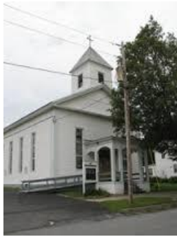
SUMC at 51 Church St., Schuylerville Sunday Worship Service at 11 AM