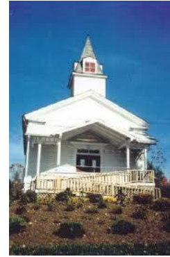
QSUMC at 466 Route 32 South Sunday Worship Service at 9 AM